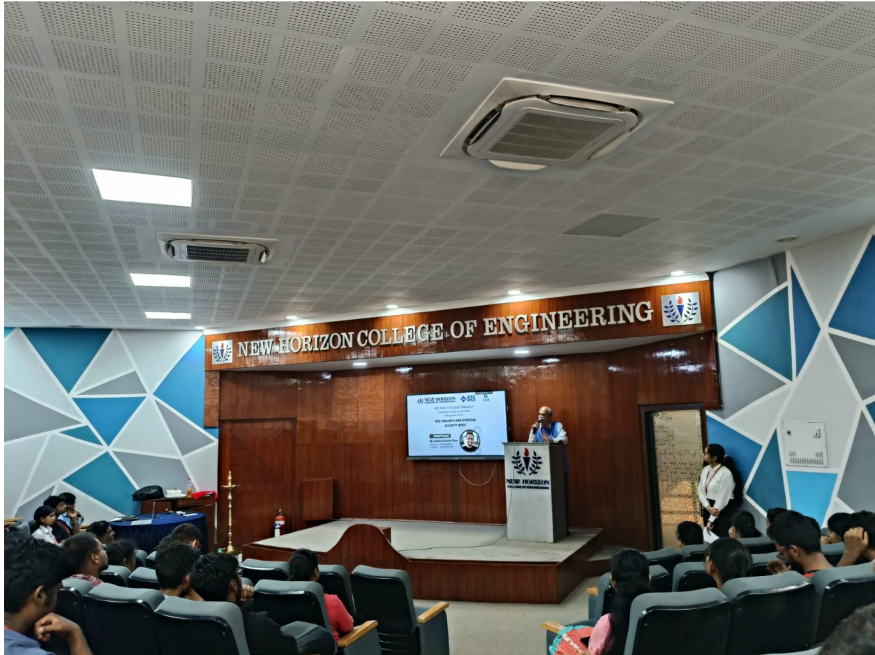
Photos from the Expert Lecture